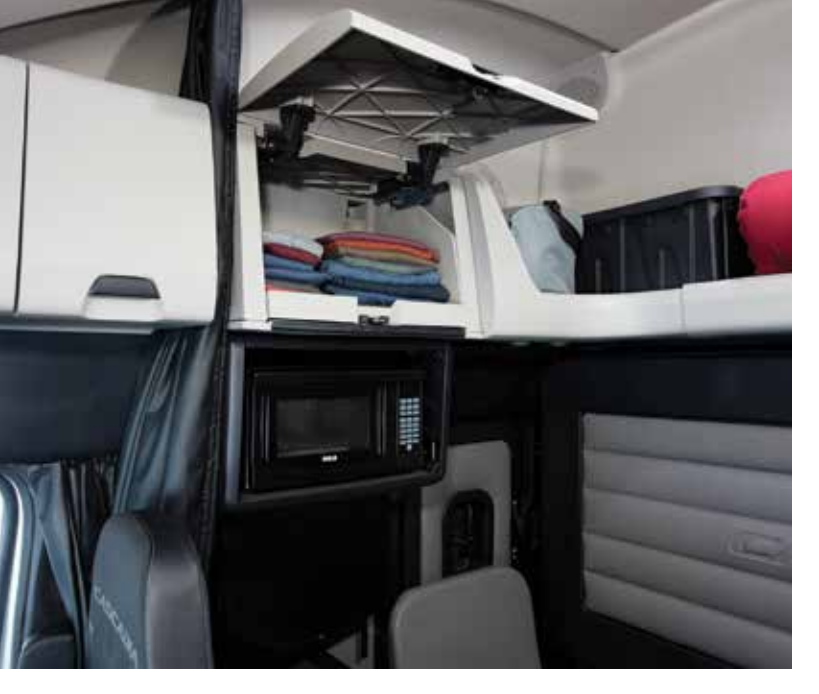
FLAT PANEL TV BRACKET (ACCOMMODATES UP TO A 26" TV), LARGE MICROWAVE CABINET WITH SECURING STRAPS AND OVERHEAD STORAGE BINS SHOWN ON 72" RAISED ROOF MODEL