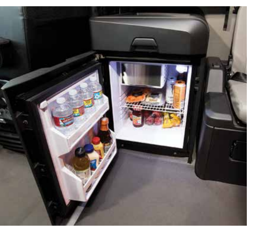
OPTIONAL FACTORY INSTALLED REFRIGERATOR/FREEZER AVAILABLE ON 72" RAISED ROOF AND MID-ROOF XT MODELS