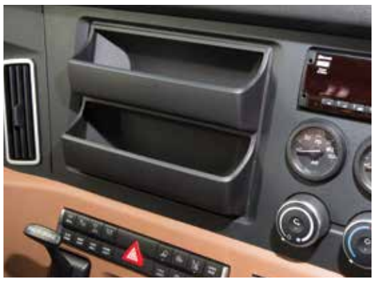
Auxiliary dash panel with storage pockets