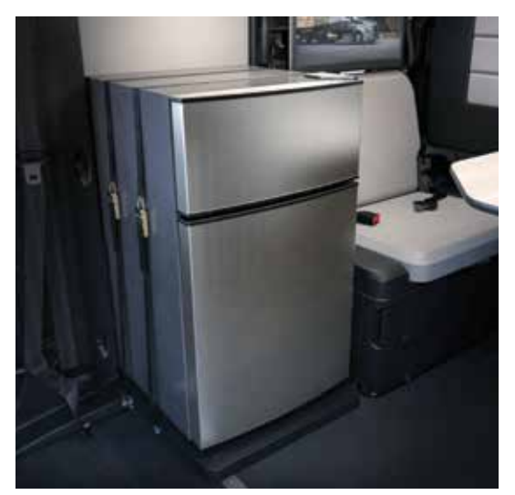
Customer-furnished refrigerator or cooler mount with straps