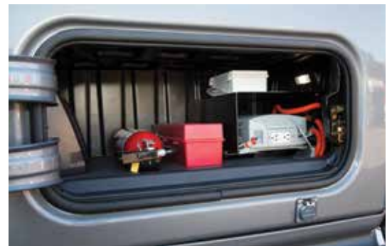
Factory-installed 1,500-watt inverter